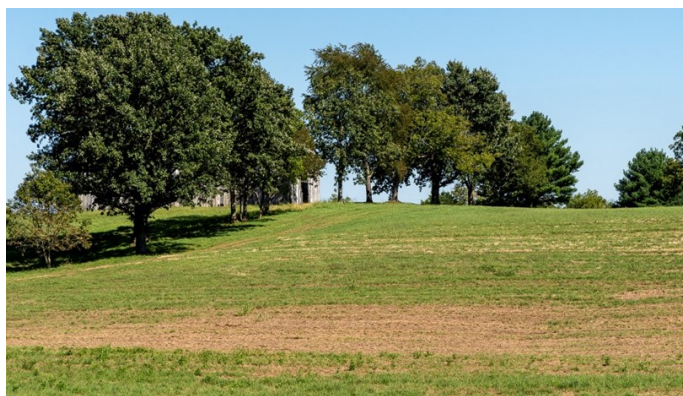
Figure 1. Typical fall armyworm damage in a young orchard grass stand.

In 2021, Kentucky was one of many states that were impacted by a historic outbreak of fall armyworms. That year marked perhaps the worst year for the pest since the 1970's and has inspired fear and dread about these hungry, hungry caterpillars rearing their head again. In the past week, reports from western and central Kentucky have indicated that some folks are seeing egg masses and fall armyworms in turfgrass areas. The sudden onset of fall armyworm in 2021 created temporary shortages of effective insecticidal remedies. Reports from