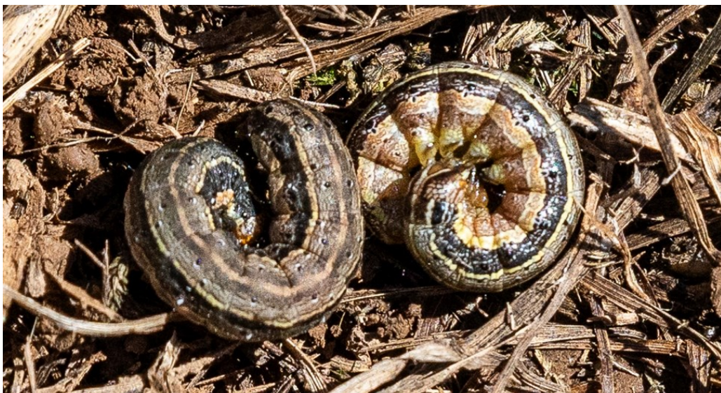
Figure 2. Two large fall armyworm larvae forced out of the ground by a soapy water drench. Note the inverted 'Y' on the headcap of the larvae on the right.

Note: Jonathan Larson and Ric Bessin, both UKY entomologists, contributed significantly to this article.