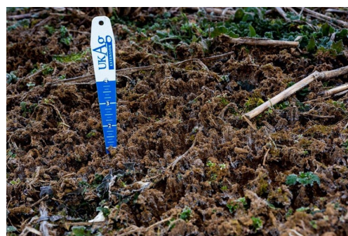
Figure 3. Freeze and thaw cycles during late winter result in the formation of cracks in the soil surface often referred to as a "honeycomb". This heaving incorporates clover seeds into the soil and is commonly referred to as "frost seeding".

Soil test and adjust fertility. For clover and other improved legumes to persist and thrive in pastures, an environment conducive for their growth must be created. This starts with proper soil fertility. Prior to frost seeding clover, soil test pastures and hayfields then lime and fertilize pastures according to the soil test recommendations.