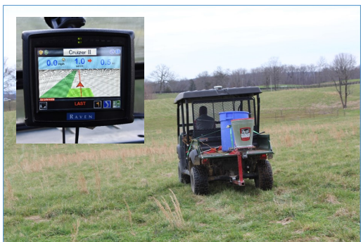
Figure 2. Frost seeding is accomplished by broadcasting clover seed onto closely grazed pastures in late winter or early spring. Using GPS guidance helps operators maintain equal spacing between passes and consistent speed (inset picture).

Clover stands in pastures thin overtime due to various factors and require reseeding every three to four years. There are several techniques for reintroducing clover into pastures including no-till seeding, minimum tillage, and frost seeding. Of these techniques, frost seeding requires the least amount of equipment and is the simplest to implement. Frost seeding is accomplished by broadcasting clover seed onto existing pastures or hayfields in late winter and allowing the freezing and thawing cycles to incorporate the seed into the soil (Figure 2 and 3). This method works best with red and white clover and